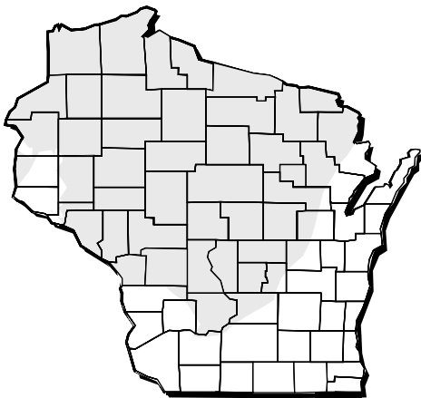
Figure 1. Limestone deposits

Light portions of the map show areas with limestone deposits.