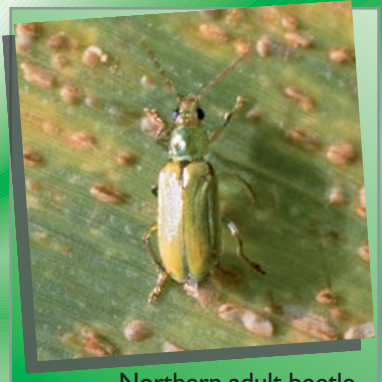
Northern adult beetle

Adult corn rootworm beetles emerge from the soil in early to mid July. They mate and lay eggs during August and early September. The eggs overwinter and hatch in early June the following year. There is only one generation of corn rootworms per year.