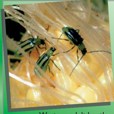
Western adult beetle