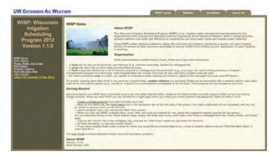
Online WISP program home page

You will need to enter daily reference ET values, irrigation and rainfall amounts, and percent of crop canopy development. To track multiple irrigation systems or fields, you may need to add a page to the spreadsheet program for each irrigation system to be tracked.